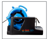
only 26" tall with an air mover installed