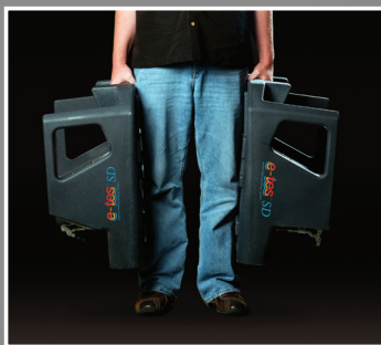
EASY TO CARRY