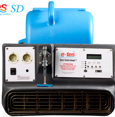
120 volt shown, also available in a 240 volt version

E-TES SD Low-Profile 120V #MB120LP $2,395 E-TES SD Low-Profile 240V #MB240LP $2,495